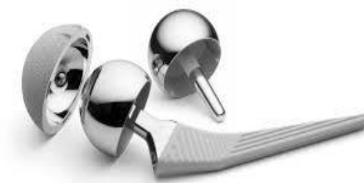
Fig. 2. Metallic hip implant

In the twentieth-century stainless steel and cobalt–chrome-based alloys were successfully used in orthopedic applications. Fig. 2 shows metallic implant.