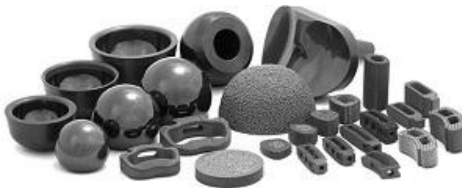
Fig. 4. Silicon nitride based spinal and orthopedic implants-courtesy Amedica Corp. USA.

Boron compounds are widely used in a tribological application like friction modifier, antioxidant, antiwear additives with the advantage of environmentally friendly. It is also a very favorable element for coatings and thin films in the biotribological and biomedical application. Anabtawi et.al. [51] evaluated the biocompatibility of boron coatings and Klepper et.al. [52] presented tribomechanical properties of thin boron coatings on cobalt alloy in an orthopedic application with no loss of coating during the test. They concluded that thin coating of boron on Co-Cr-Mo surface could prolong the life of Co-Cr-Mo – UHMWPE contact in the hip joint. The lubrication properties of h-boron nitride are comparable to those of phospholipids, which are the best lubricant in human [53]. Boron is a very hard material and provides lubricity with boric acid when boron oxide formed in a moist environment. The addition of boron nitride in non-oxide ceramic may present a good alternative for joint replacement material.